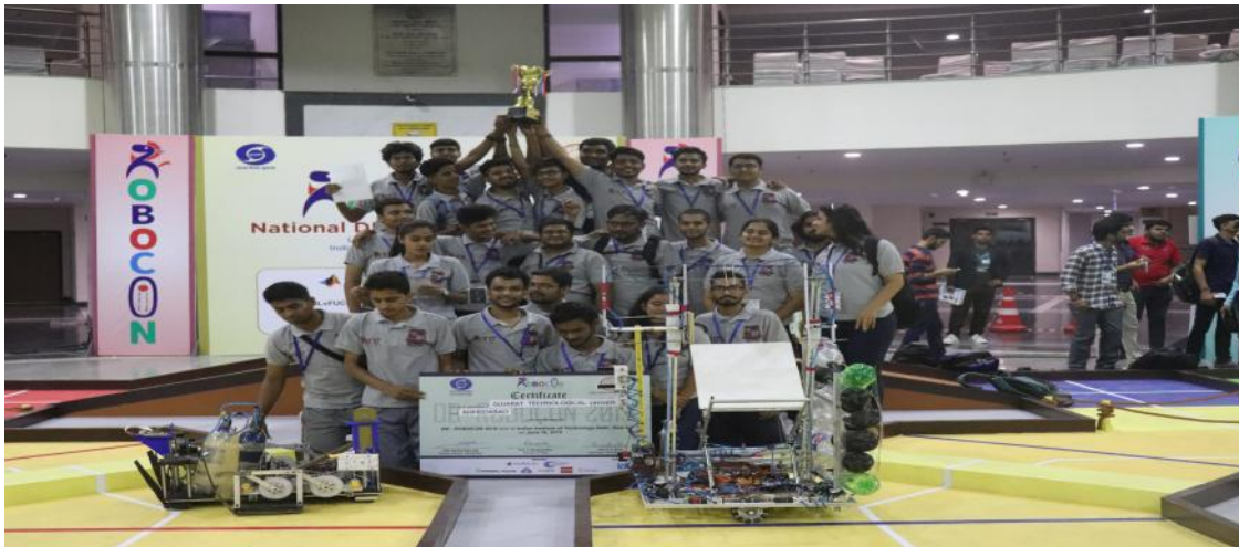
GTU ROBOCON 2019 Team with Trophy

Winners of : ICT Enabled University Award E-India - 2009 ❖ Manthan Award - 2009 ❖ GESIA Award - 2011 ❖ Digital Learning WES - 2011 Award ❖ AIMS International Innovative University Award - 2013