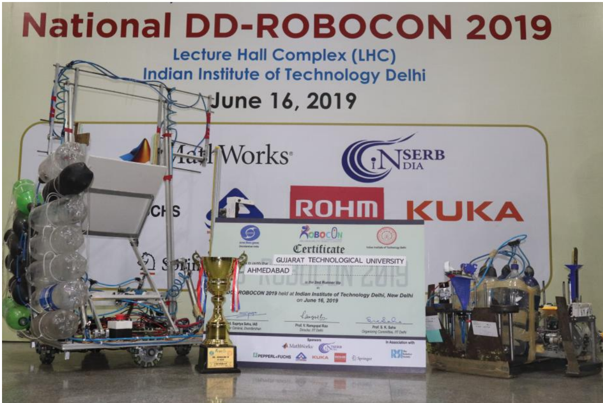
Developed ROBOTs for ROBOCON 2019 & Winning Trophy , Certificates, Sensor Kit

(ગુજરાત અધિનિયમ ક્રમાંક : ૨૦/૨૦૦૭ દ્વારા સ્થાપિત)