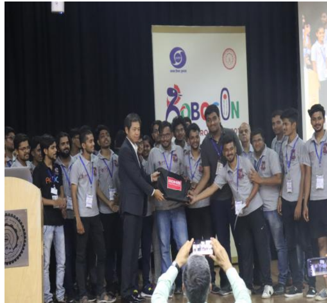
Receiving ROHM Semiconductor Kit

Winners of : ICT Enabled University Award E-India - 2009 ❖ Manthan Award - 2009 ❖ GESIA Award - 2011 ❖ Digital Learning WES - 2011 Award ❖ AIMS International Innovative University Award - 2013