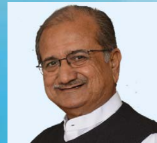
CHIEF GUEST Shri Bhupendrasinh Chudasama Hon'ble Minister, Education (Primary, Secondary and Adult), Higher and Technical Education, Government of Gujarat