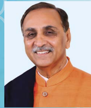
Shri Vijaybhai Rupani Hon'ble Chief Minister Gujarat