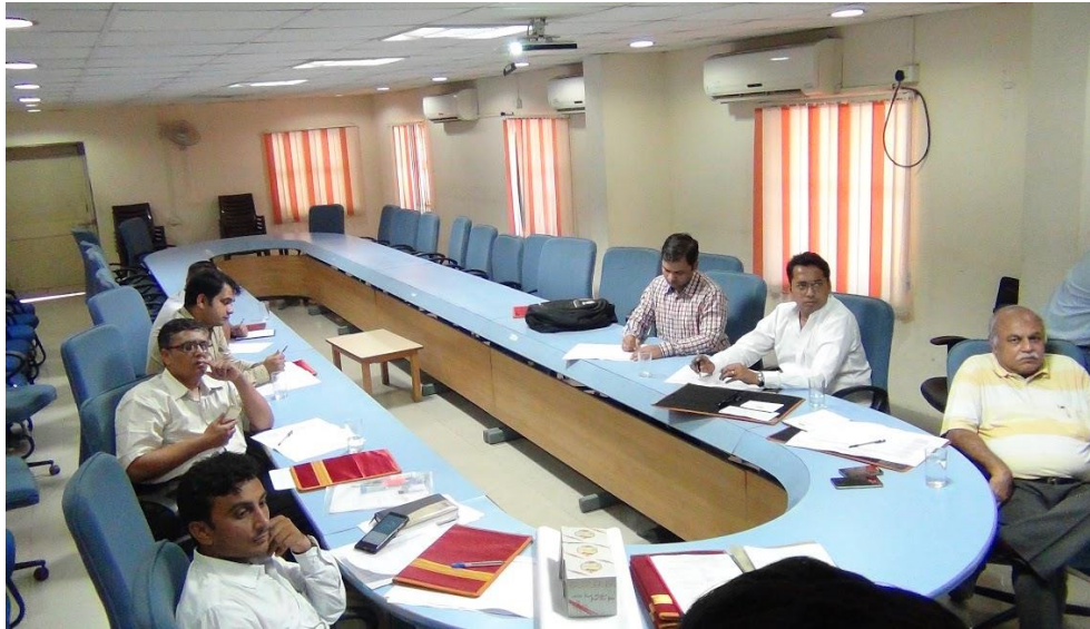
Screening Committee Members