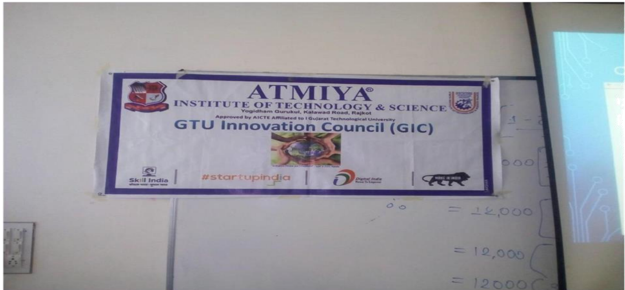
Snap 4: GIC Event