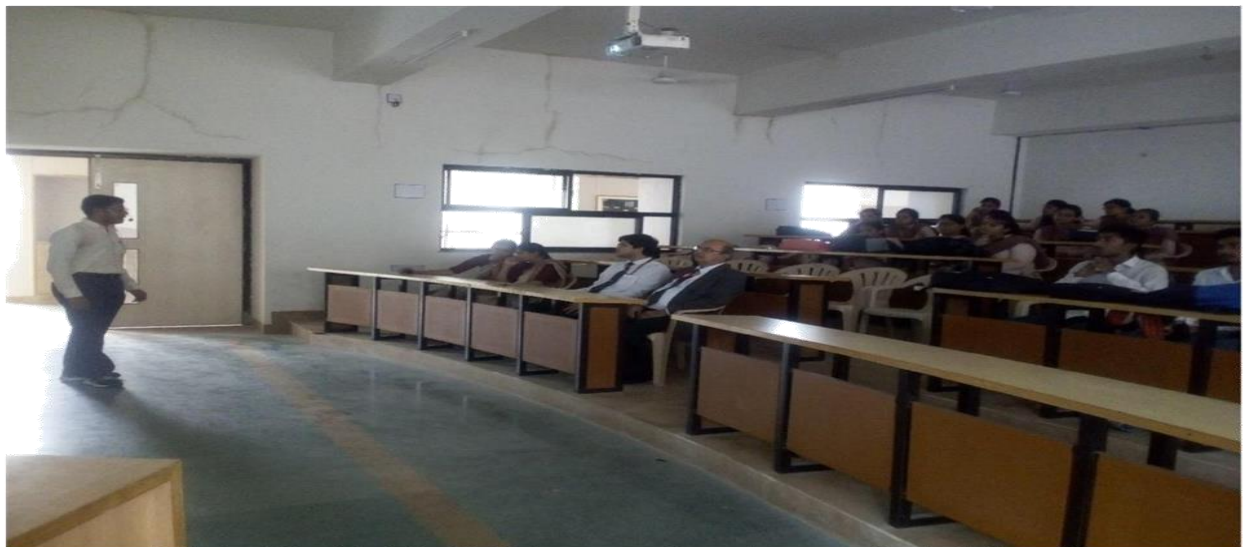
Snap 3: Audience