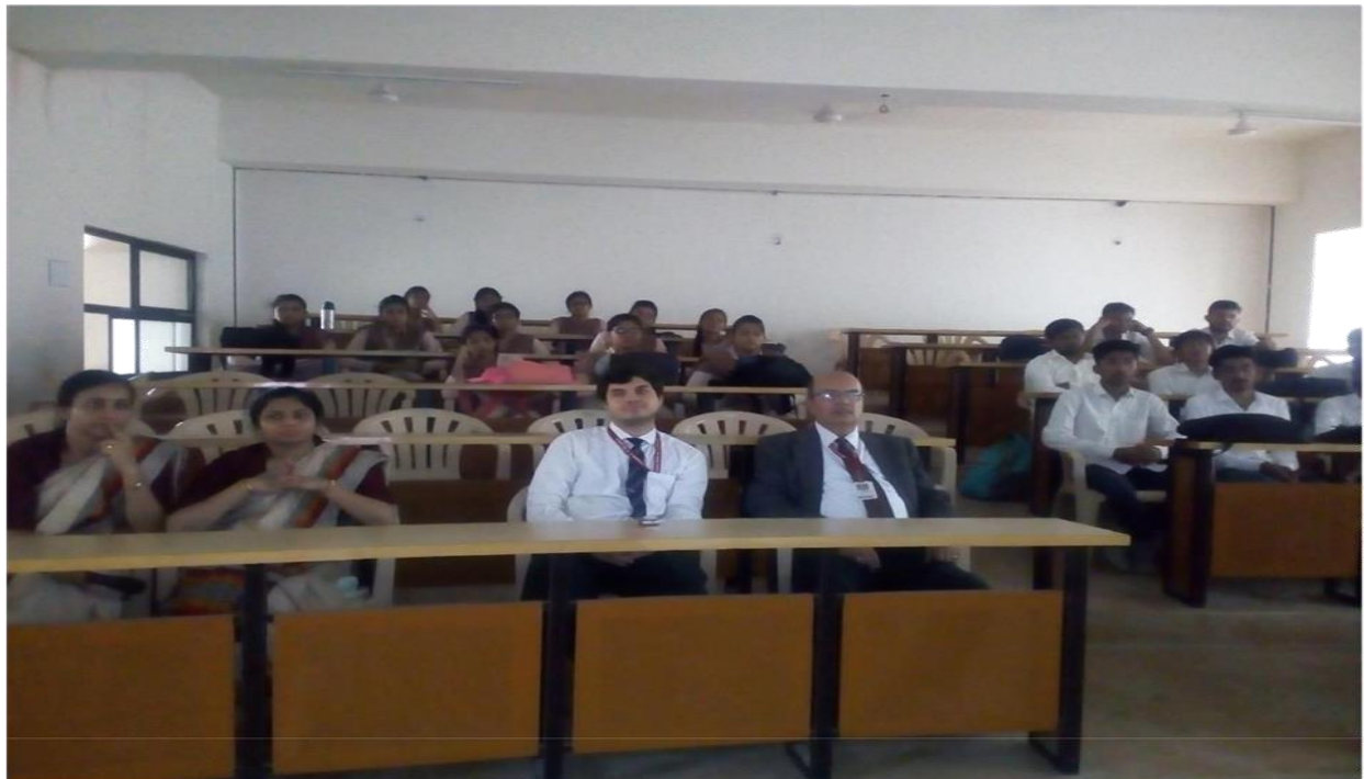
Snap 5: Faculties at the session