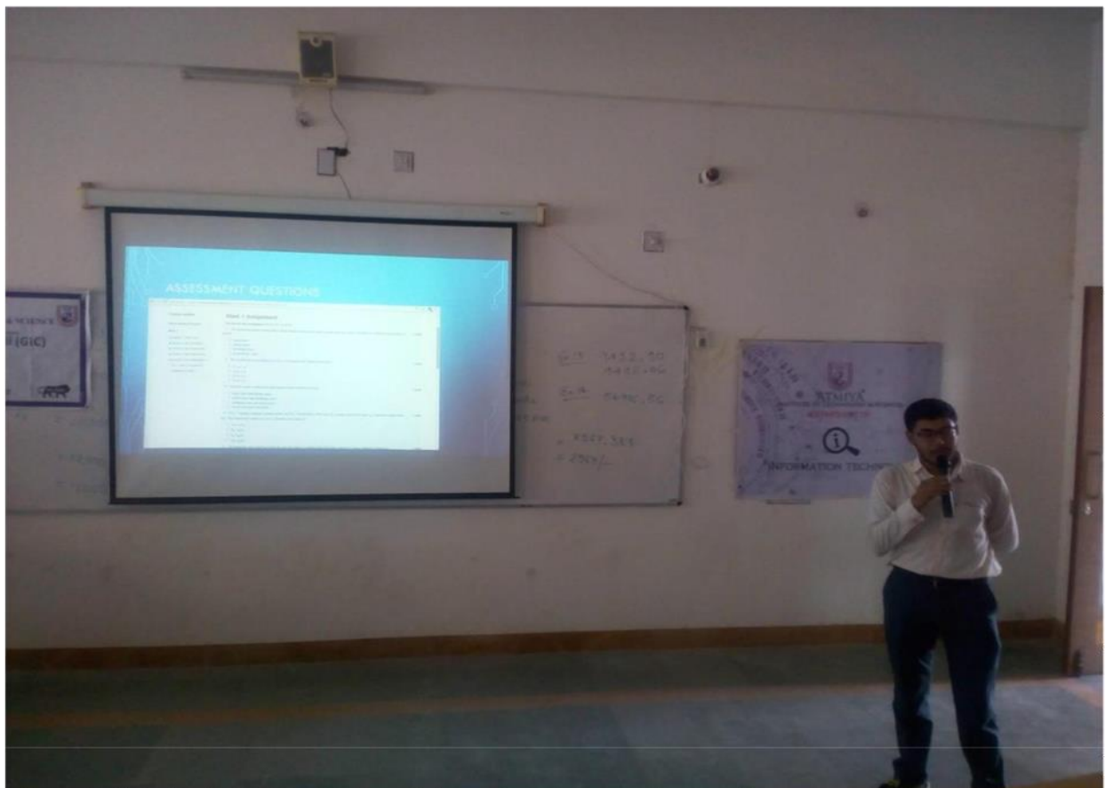
Snap 1:Resource Person