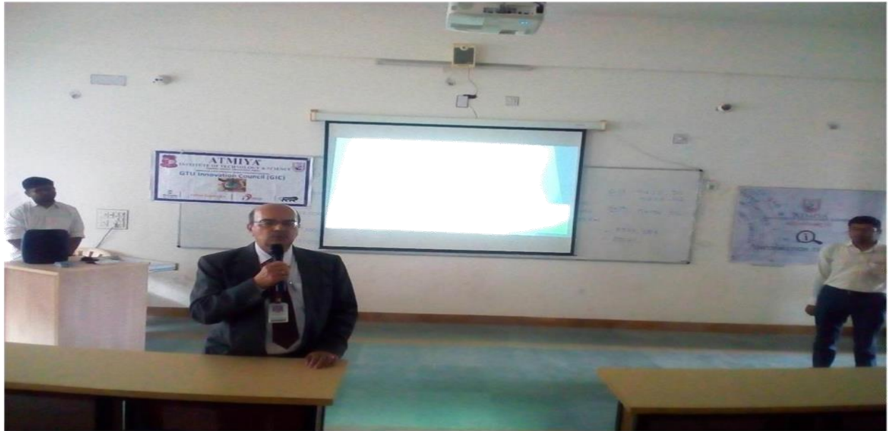
Snap 2: Principal Sir addressing the students